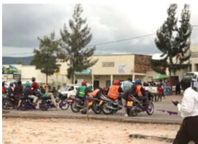
Motor bikes for public transport

The micro-entrepreneurs turn to MFIs because they have difficulties in meeting the credit criteria required by the conventional financial system. In addition to loans for business purposes, MFIs provide short-term personal credits and savings. Loans are often used to purchase assets for business purposes such as motorcycles and bicycles, sewing and weaving machines, wood processing equipment, and food processing machines. The MFIs tend to have a physical presence in a specific area and also to have an affinity with specific target groups based on religion, gender and age. Currently, the microfinance industry in Rwanda is