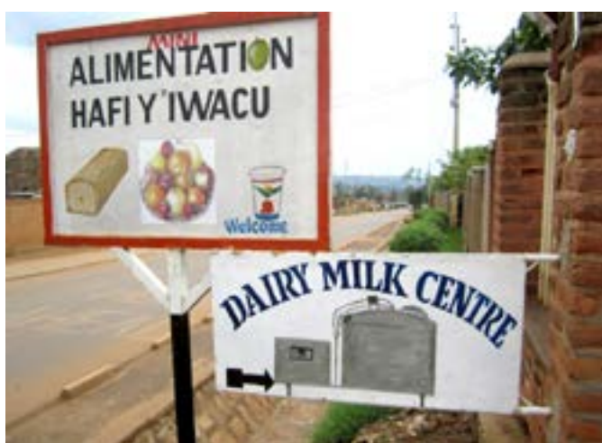
Milk cooling center, a typical business to benefit from micro-leasing