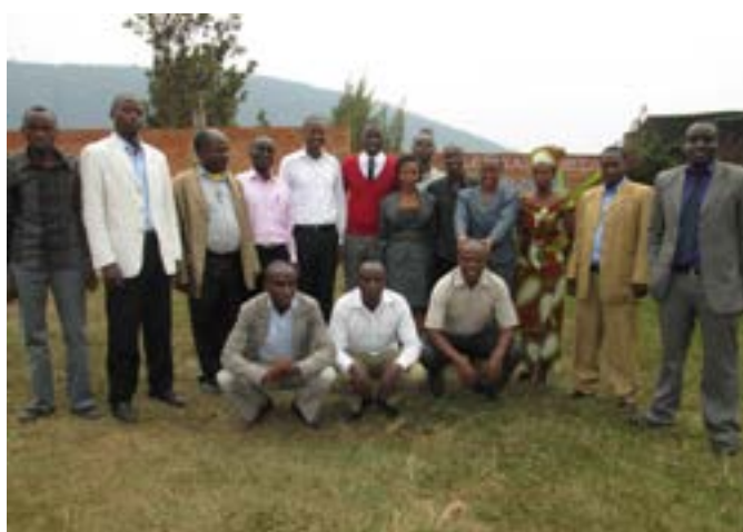
Micro-leasing project team in Kigali

Using the market strategy developed with DLL, the MFIs not only promoted micro-leasing via various media but also engaged in formal educational events to increase awareness of the opportunities provided by microfinance and micro-leasing. These events, which were attended at times by entire villages, were adapted to rural areas (where financial literacy is lower). Extended marketing events and initiatives have also been planned for the growth phase of the pilot.