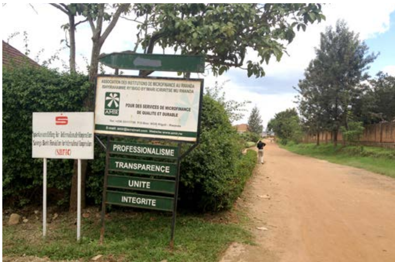
AMIR office entrance in Kigali, Rwanda